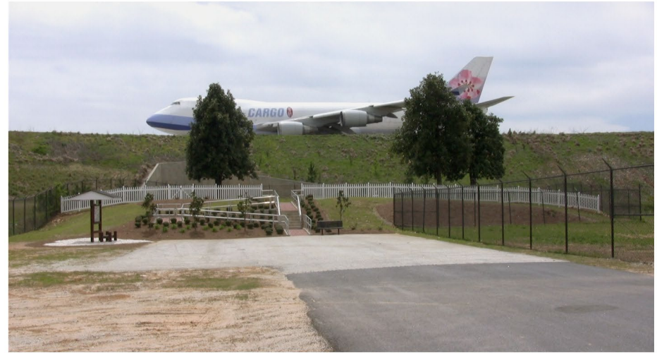
The End of the Day, Part 2 (State Route 139) 2012 Single-channel HD video, stereo sound Installation dimensions variable NTSC, 14:00 (Image: 2 video stills)