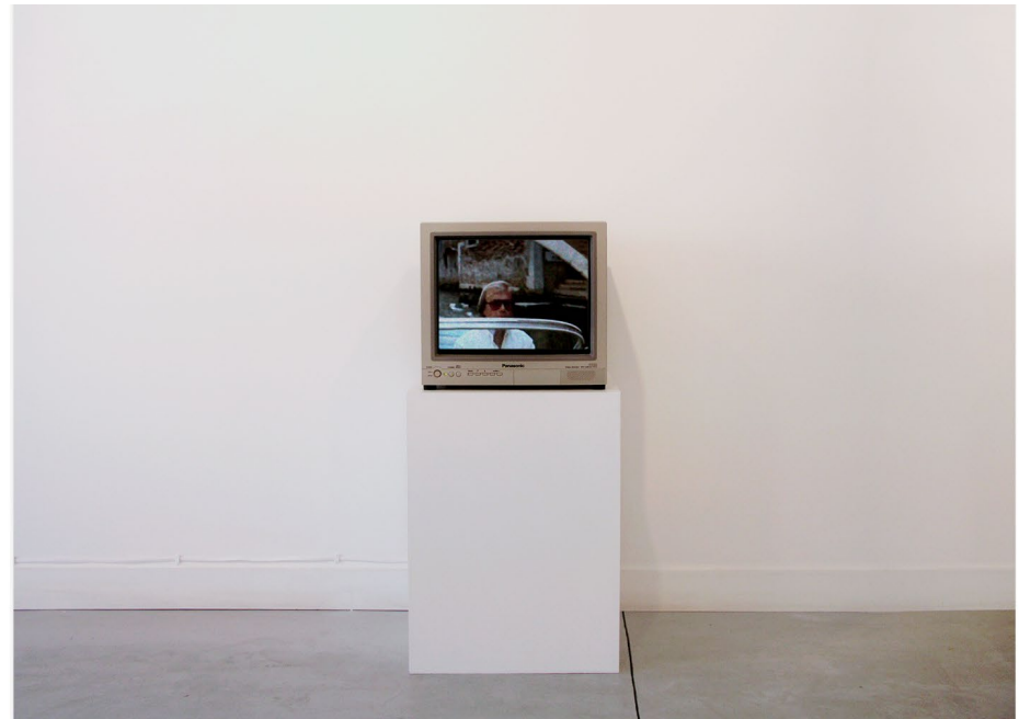
The 74th Minute (A Portrait in 1/115th Time) 2006 DVD video (115 min.), CRT monitor, poster Installation dimensions variable (Installation view: Nabit Art Gallery, University of the South, Sewanee TN)