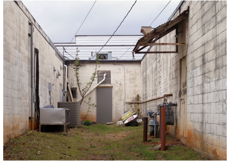
Rear-Side Economies 2009 20 Digital C-Prints, 13 x 18 cm (each)