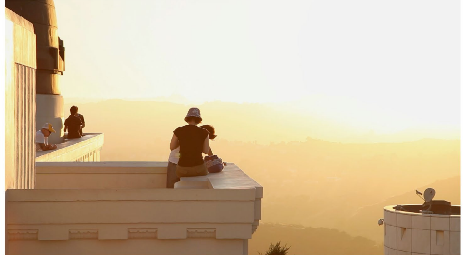
The End of the Day, Part 3 (Griffith Park) 2013 Single-channel HD video, stereo sound Sound: Noël Akchoté Installation dimensions variable NTSC, 11:00 (Image: 2 video stills)