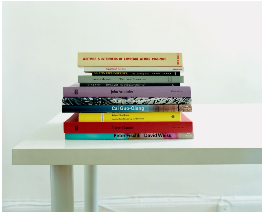
Shelf Life 1 (Inventory Design) 2006 (Image: 2 documentation photographs)

In conjunction with an invitation to exhibit and lecture at a small university in a less-populated section of the United States, an informal reconfiguration of store inventories took place.