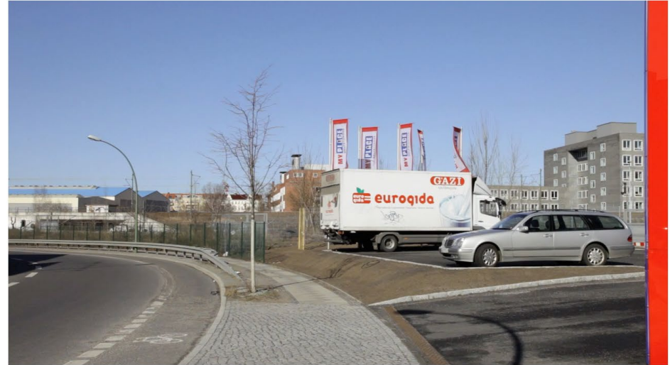
A Brief Report on Ellen-Epstein-Straße 2012 Single-channel HD video, stereo sound Sound: Mika Vainio Installation dimensions variable NTSC, 4:00 (Image: 2 video stills)