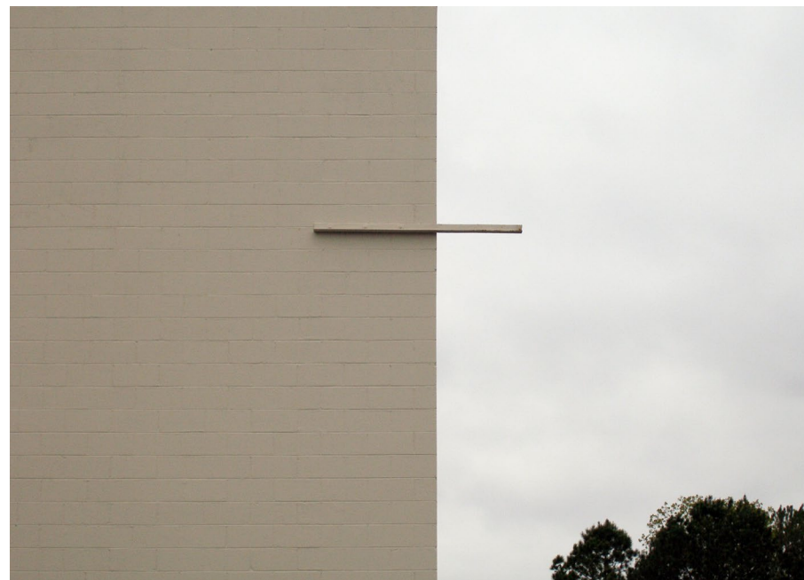
Rear-Side Economies 2009 20 Digital C-Prints, 13 x 18 cm (each)