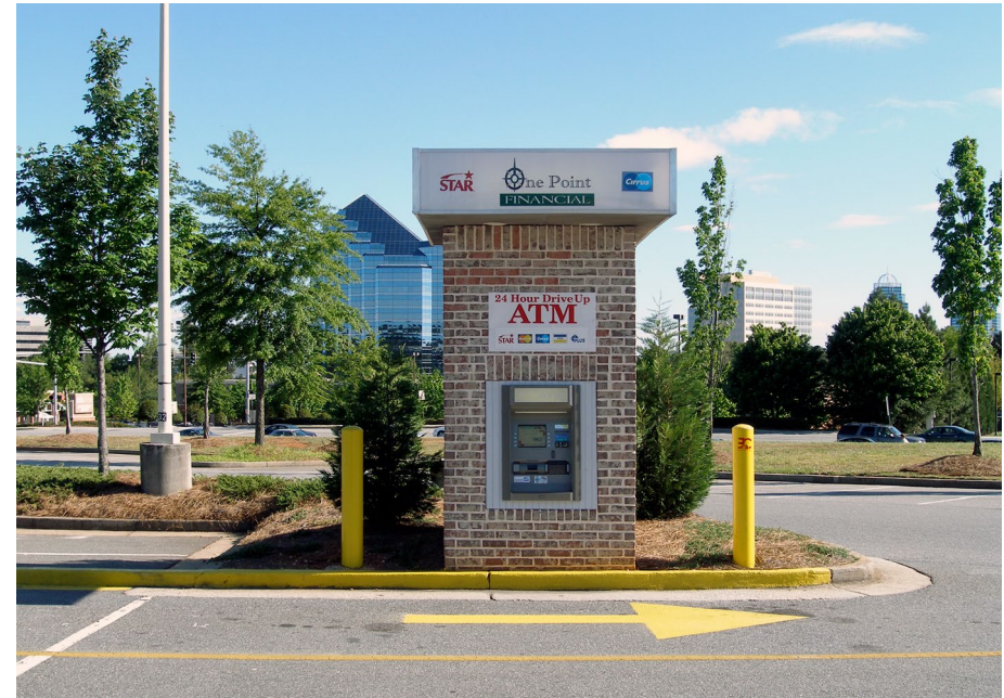
Interactive Architecture 2002-2004 20 Digital C-Prints, 13 x 18 cm (each)