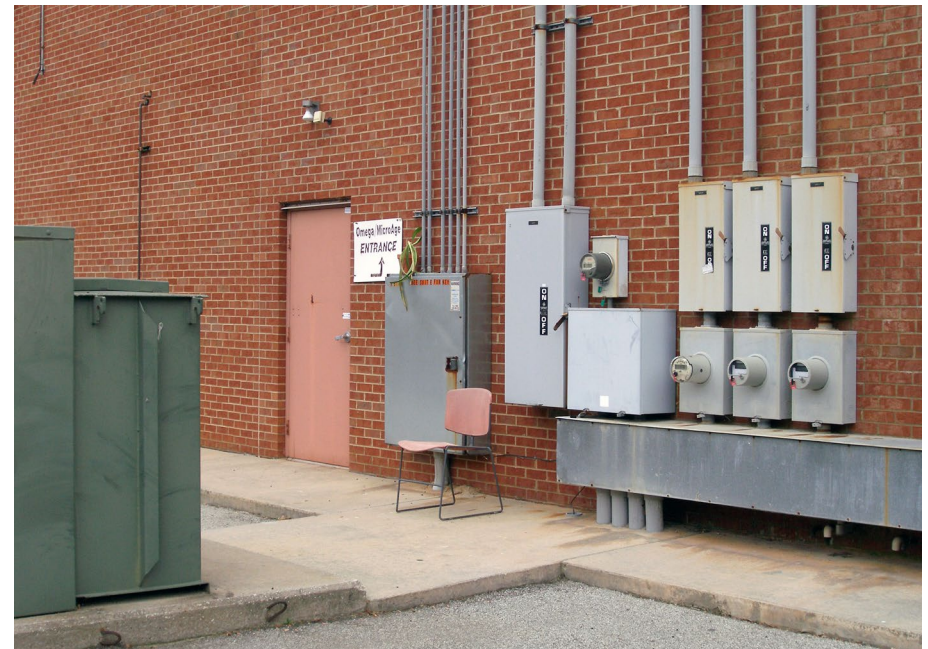
Rear-Side Economies 2009 20 Digital C-Prints, 13 x 18 cm (each)