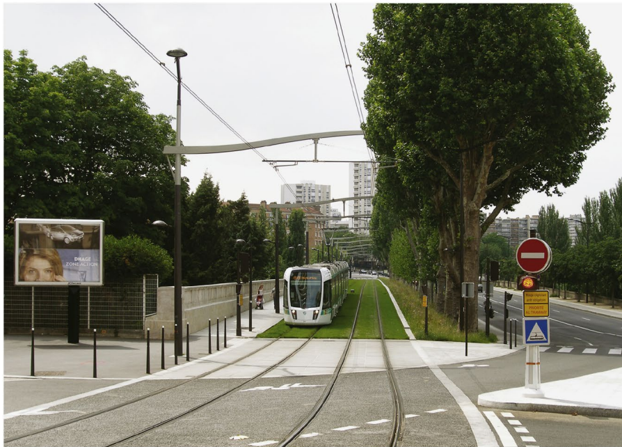
T3- Along Boulevard Kellermann, Paris, France (2006) Opened on December 16, 2006, line T3 is the first modern tramway in Paris proper. It is known as the "Tramway des Maréchaux" because it follows the boulevards that were built on the route of Adolph Thiers' fortifications around Paris (1841-45) that were named after many of Napoleon's marshals (maréchaux). It connects Boulevard Victor RER station in the western part of the XVe arrondissement with Porte d'Ivry Métro station in the XIIIe arrondissement.