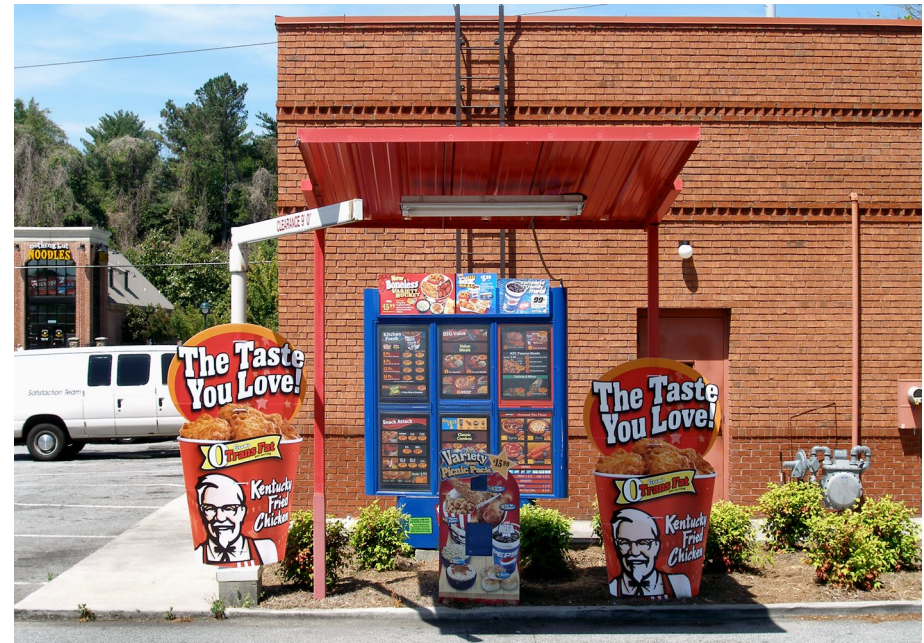
Interactive Architecture 2002-2004 20 Digital C-Prints, 13 x 18 cm (each)