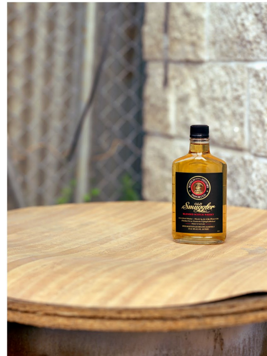
Shelf Life 2 (Old Smuggler) 2006 Posters, 50 x 60 cm

In the commercial zone of a major urban center, a promotional campaign was created to support a marginal product.