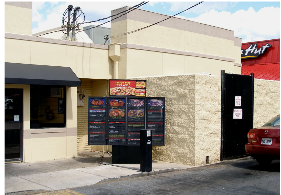
Interactive Architecture 2002-2004 20 Digital C-Prints, 13 x 18 cm (each)